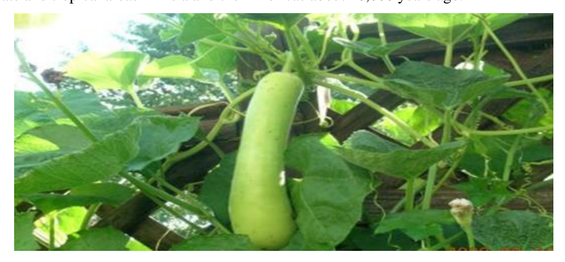
Figure 1: Plant of Lagenaria siceraria

The Cucurbitaceae family is tropical and sub-tropical in origin, and does not tolerate cold soils or cool growing temperatures. Geographically it occurs throughout India and is now cultivated worldwide. It is generally accepted that Lagenaria was indigenous to Africa and that it reached temperate and tropical areas in Asia and the Americas about 10,000 years ago.